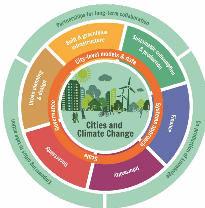
Figure 1. Pathways for climate adaptation and mitigation in cities

The Global Research and Action Agenda on Cities and Climate Change Science is organised into three sections: 1. crosscutting issues and knowledge gaps; 2. key topical research areas; and 3. suggested approaches to implement the Research and Action Agenda. This thematic structure is shown in Figure 1.